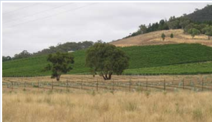
Vineyards and truffle orchards, Mt Majura

Concern about catchment health is a recognition that both urban and rural residents need to leave smaller footprints on the land. Most people want to leave the land in as good or better condition for generations to come. That's not new. What is new are the challenges facing our countryside: an increasing population, development of rural areas and climate change. These challenges mean that many practices are no longer sustainable because they do not fit with our new understanding of the value and management needs of our natural assets.