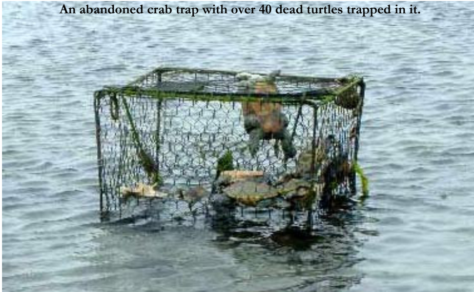
An abandoned crab trap with over 40 dead turtles trapped in it.

Such notices may usefully serve both to alert Australians to the dangers of enclosed yabby traps and also encourage the use of wildlife-friendly alternatives, such as simple baited lines or lift-style hoop nets. Accordingly, we hope that those who care about platypus conservation will consider directing their purchases of outdoor recreational equipment to retailers, like Ray’s Outdoors, who take steps to protect vulnerable freshwater species.