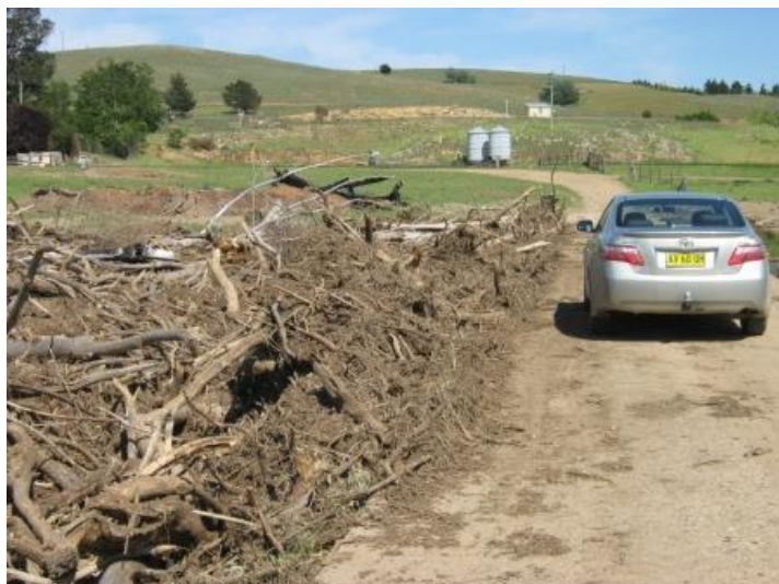
The effects of a flood event on Chakola Creek in the Numeralla Catchment