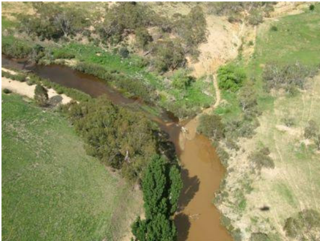
A sediment tongue coming into the Kybeyan River in the Numeralla Catchment

After a year of investigation of sediment input into the Murrumbidgee River from the Numeralla region by members of the Cooma Council, Upper Murrumbidgee Demonstration Reach, ActewAGL, the NSW Department of Investment and Industry and the Murrumbidgee Catchment Management Authority (MCMA), a number of sites have been identified and targeted for erosion control work in the Numeralla catchment.