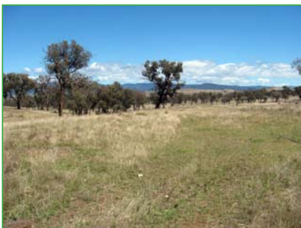
View to the Brindabella Range

The River Walk , 5.4 km return from the car park, continues on from the Dam Walk to the Molonglo River. There are plenty of good vistas, including to the Brindabella Range as well as opportunities to hear and see birds and enjoy the wildflowers.